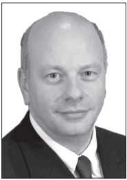
Kevin Foster President The Broadband Forum

In 2010 the Board of Directors determined that an end-to-end approach to broadband was required to ensure we provide the full scope of specifications needed for the industry to take broadband to the next level. In 2011, that approach was implemented across all working groups of the Forum.